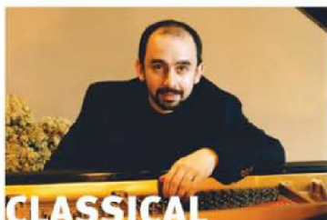
CLASSICAL DPO kicks off 13