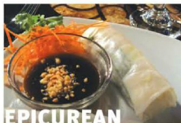
EPICUREAN Loving Thai at Sa-Bai 22