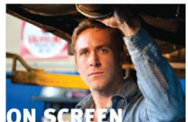
ON SCREEN Ryan Gosling in Drive 26