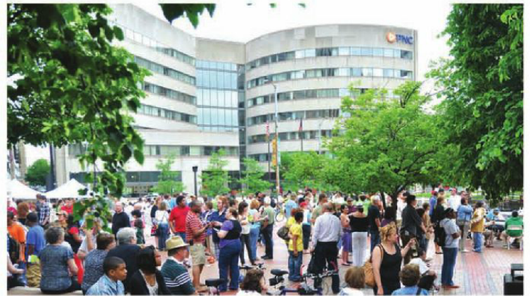
A young Urban Nights attendee participating in the Paint the Street event at May 2011's Urban Nights [left] and the crowd from May 2011's Urban Nights at Courthouse Square [above].