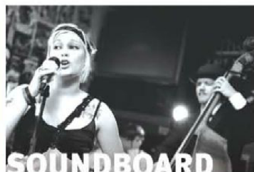
SOUNDBOARD End Times Spasm Band 14