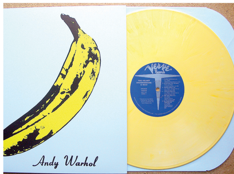
The face of fetish: [l to r] a delectable food image to whet the appetite; the Velvet Underground's debut original pressing on colored vinyl

and basking in the glow of wonderment that comes from witnessing the truly remarkable? Or is it really as simple as straight up procrastination? In the opinion of a member of the clergy whom I know personally (and would rather remain anonymous), the light or the dark of the situation lays in as much the intent of the viewer as in the viewed, a sort of Rorschach of intention. A rabbi I spoke with had a similar take on the subject, using as an example how a knife can be both good and bad, depending on how it is used. If we are looking for beauty, we will find it.